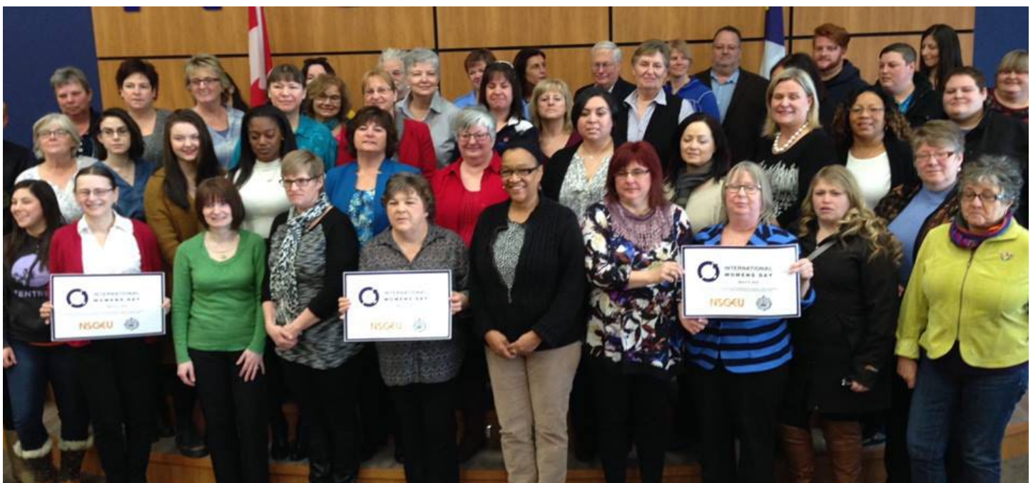
The NSFL's inaugural International Women's Day Breakfast attracted a large and diverse group of attendees representing multiple sectors and organizations

For more information about International Women's Day, please visit http://www.internationalwomensday.com/ .